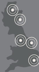
BAIRDS MALTING & THOMAS FAWCETT MALTSTERS United Kingdom