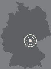
WEYERMANN® SPECIALITY MALTS Bamberg Germany

Marr Farms in Methven grow trial breeds and established malting barley varieties.