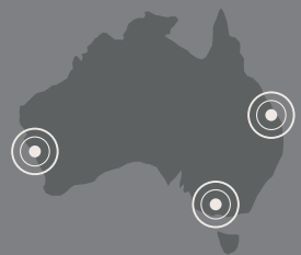
BARRETT BURSTON MALTING Australia